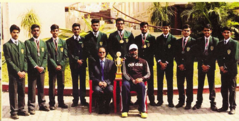
The School Team with the Principal and the Coach